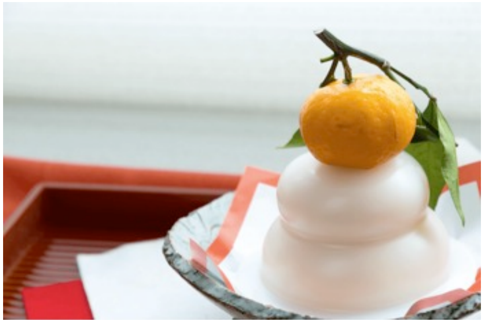
Kagami mochi, a Japanese (and Hawai'i) custom during New Year's.

The pocket-sized treat came to Hawai'i in the mid-1800's through Japanese plantation workers, who carried on the traditional mochi-making ceremony, called mochitsuki, during New Year's. In mochitsuki, mochigome is cooked and pounded in a wooden or stone mortar called usu, until it is smooth and chewy, and then molded into various shapes by hand.