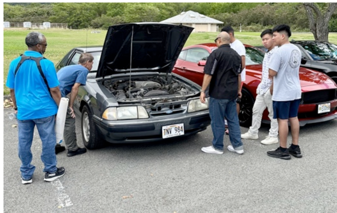
A bone-stock 1988 LX during the Hot Summer Stampede Cruise on 17 Sept. at Kualoa Beach Park.