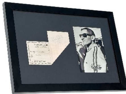
Convention raffle item: Shelby American, Inc. check paid to driver Ken Miles with Ken's endorsement signature.