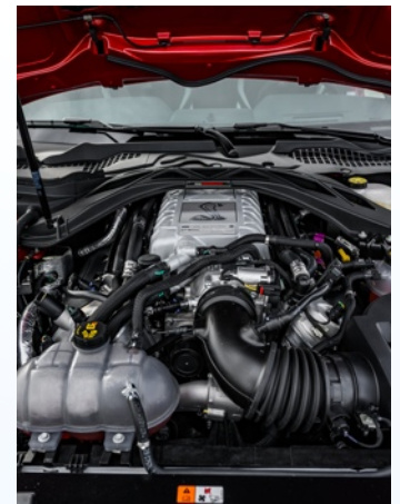
A GT500 on the Dyno